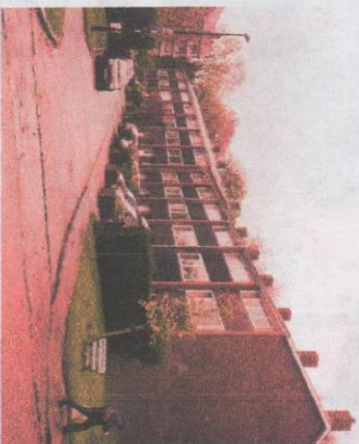
VIEW FROM BOTTOM OF SYDENHAM RISE - BEFORE AND AFTER