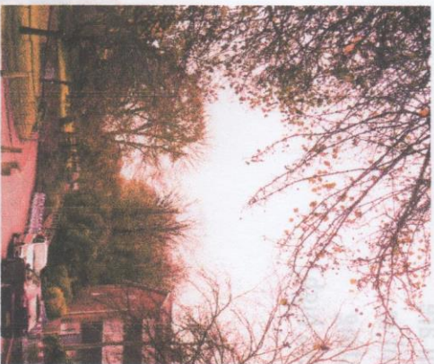
VIEW FROM BOTTOM OF ELIOT BANK - BEFORE AND AFTER

The proposed development covers grassland on the Forest Estate (Eliot Bank) as well as public housing on garages and car park off Knapdale close. This is in addition to the already granted planning permission for a large development (41 flats and houses) at Featherstone Lodge, Eliot Bank.