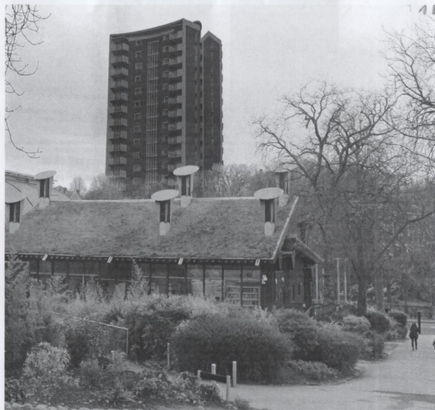
VIEW FROM HORNIMAN MUSEUM

Did you know that Lewisham Council are proposing a new private development in close proximity to the Horniman Museum consisting of a tower possibly 7, 12 or 15 storeys high?