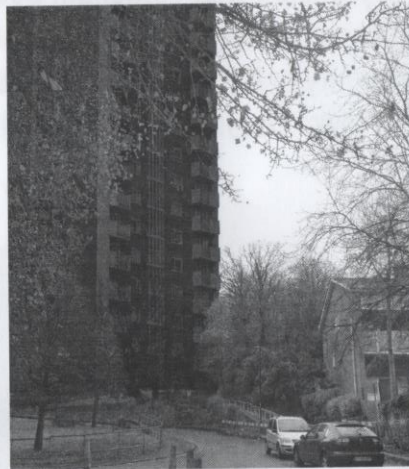
VIEW FROM BOTTOM OF ELIOT BANK