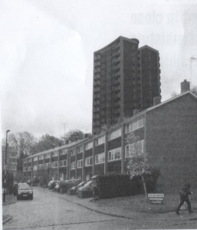
VIEW FROM BOTTOM OF SYDENHAM RISE

The proposed development covers grassland on the Forest Estate (Eliot Bank) as well as public housing on garages and car park off Knapdale close. This is in addition to the already granted planning permission for a large development (41 flats and houses) at Featherstone Lodge, Eliot Bank.