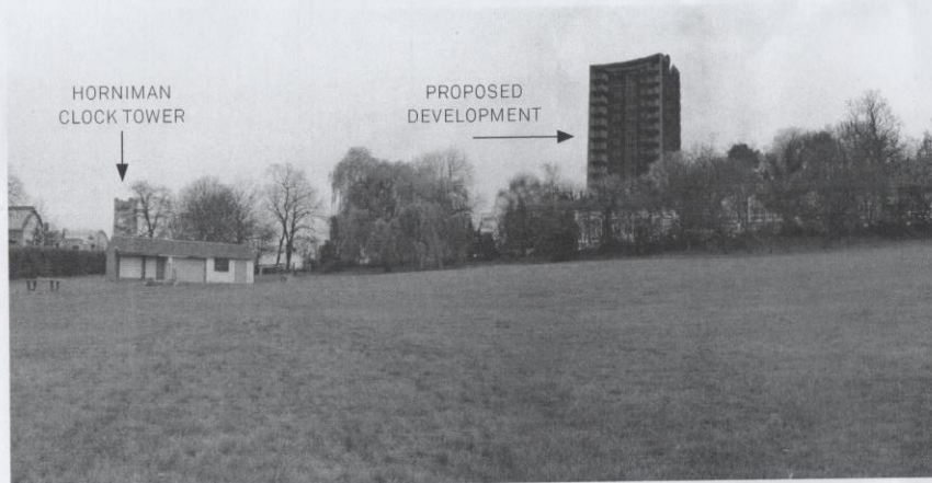
VIEW FROM HORNIMAN TRIANGLE

While most people understand the need for building genuinely affordable homes in the London boroughs, we believe that this particular scheme is ill thought out and giving over another piece of public land to private ownership.